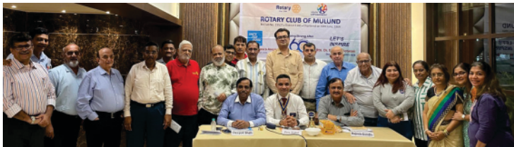
Budget Meeting on 15th July 25 at Guruprasad Hall, Mulund