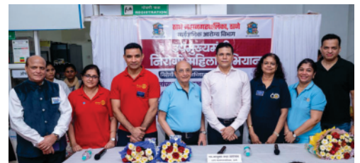
25th July 2025 Second Cervical Screening camp was held at TMC Health Centre, Rosa Gardenia, Thane. Thane Municipal Commissioner Shri. Saurabh Raoji inaugurated the camp.