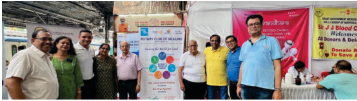
1st July 2025 : Blood Collection Drive at Mulund railway station drive. It was a joint project with other.